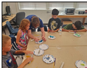
Students get creative with one of their many projects each year at the summer Art Day Camp.

Art Day Camp, organized and sponsored by the Butler County Arts Council, returns to the Aquinas High School art room with a choice of up to six different sessions over a 3-day period (July 27, 28, 31) taught by excellent art instructors. Children ages 8 and over are always pleased with their creations. Samples of their work are on display during the month of August at Hruska Memorial Library.