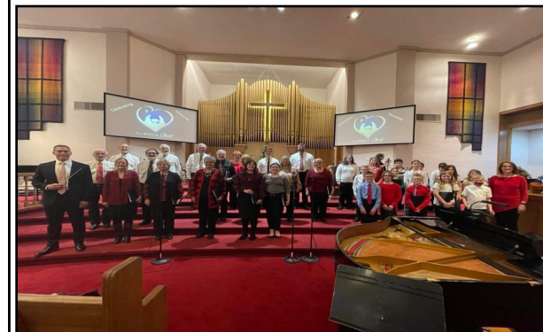
The Community Choir and the Children's Choir perform each year at the Holiday Concert.